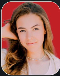
STUNT and LIFT CHOREOGRAPHER