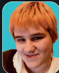
PROPS and PUPPET DESIGNER and MAKER