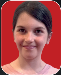
EDITH / EAGLET and THE WHITE KING