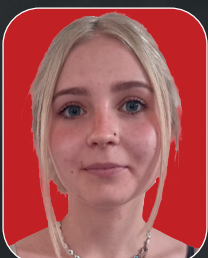
COOK and THE RED QUEEN