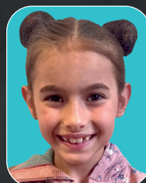
CAKE VOICE and DORMOUSE