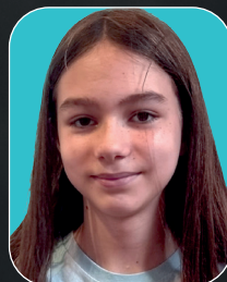
PROPS and PUPPET MAKER