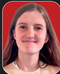
PROPS and COSTUME MAKER