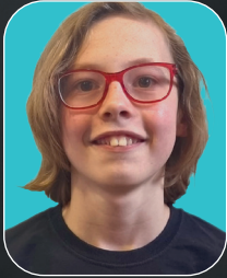
MOUSE and TWEEDLEDUM