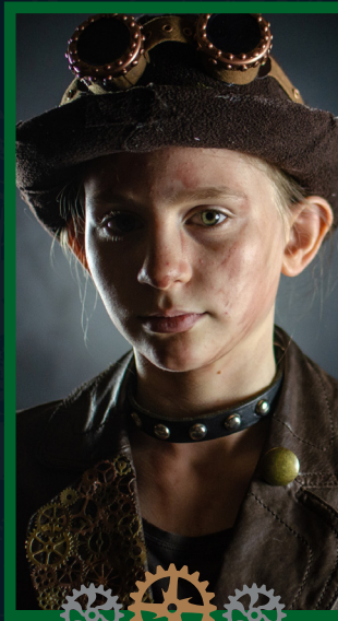
PETER QUINCE, THE DIRECTOR